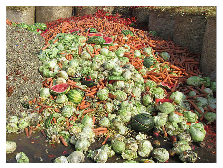
Fig. 1. Waste of vegetable origin withdrawn from sale

Project IN OIL: An innovative method for the bioconversion of by-products from the food processing industry is being implemented at the Poznań University of Life Sciences. It is performed by academics, PhD students and students of three faculties: Faculty of Agronomy and Bioengineering, Faculty of Veterinary Medicine and Animal Science and Faculty of Food Science and Nutrition.