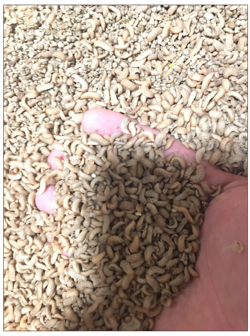
Fig. 2. Hermetia Illucens (Damian Józefiak)

aerobic digestion [Czekała et al. 2015, Czekała et al. 2012]. It is assumed that it can be sold as a valuable fertilizer or used for fertilizer purposes [Chodkowska-Miszczuk and Szymańska 2013]. This will allow to close the circulation of nutrients and give valuable nutrients for the new plant biomass.